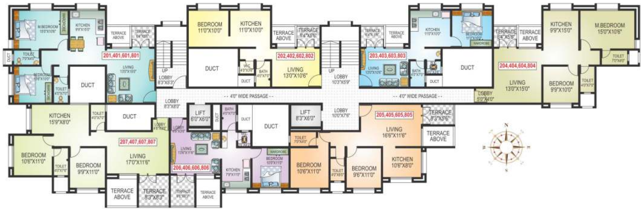
TYPICAL 2ND, 4TH, 6TH & 8TH FLOOR PLAN