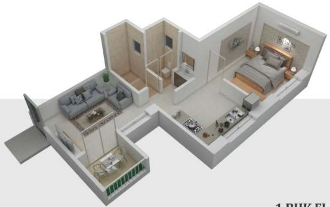
1 BHK FLAT