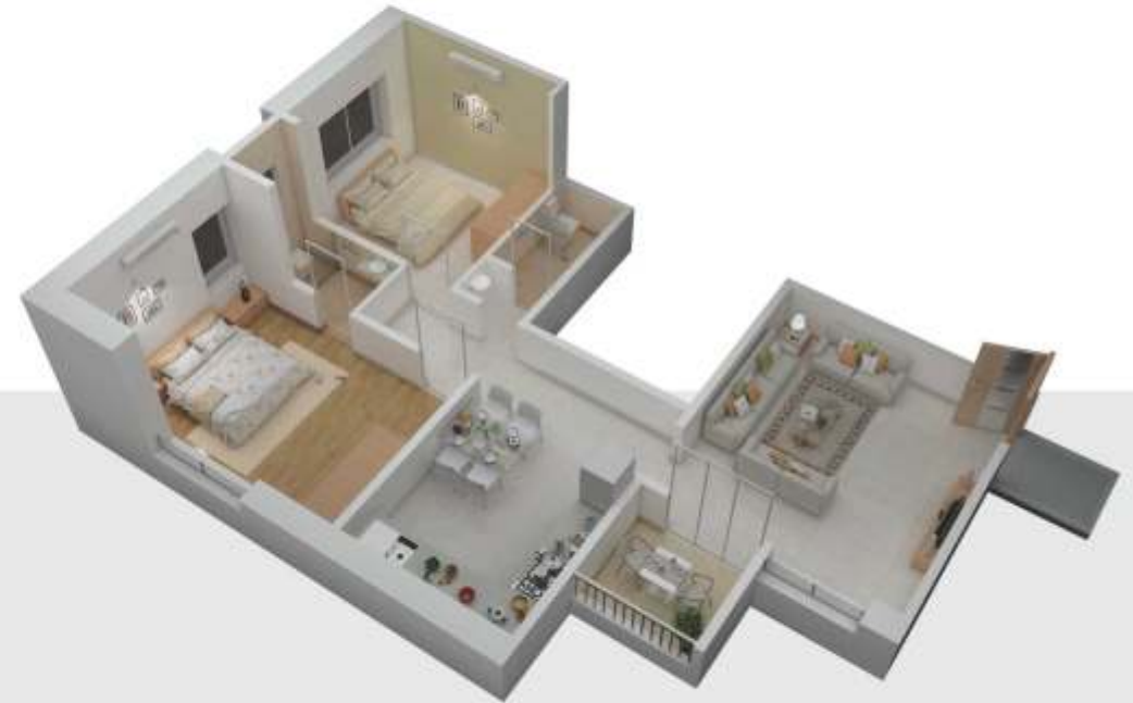
2 BHK FLAT